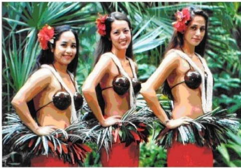
At the Arizona State Veterans Home 4141 North 3rd. Street, Phoenix AZ Just North of Indian School, East of Central

RidersUSA Presents A Hawaiian Luau With our Veterans